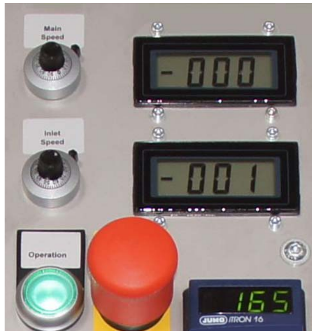
Operation panel (also available with encoder)