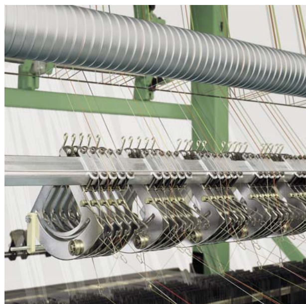
Weft feed and compensation