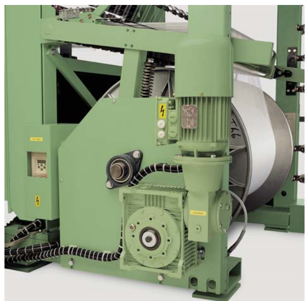
Electronic warp let-off (DIGIKAST)