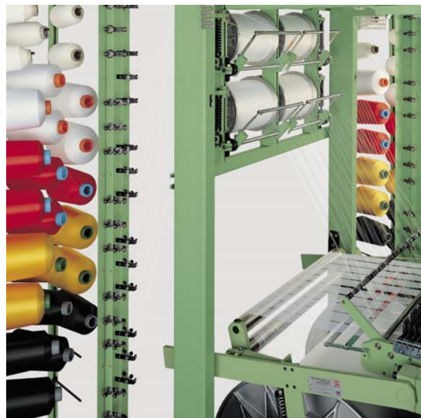
Weft and warp feed