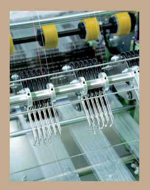
Grouped weft compensation

The NFMJ MC T/S/SS is another innovation based on the latest modular narrow fabric needle loom generation of NFM®, equipped with the electronically controlled Jacquard devices SPE3M 192, SPE3M 384 and SPE3M 768. The machine is designed for the production of multicolored labels, trimmings and name tapes. The NFMJ MC T/S/SS "Made in Switzerland" represents a synonym for effectiveness, cost-efficiency, operational safety and is designed for the production of multicolored labels, trimmings and name tapes with woven, soft edge in weft effect.