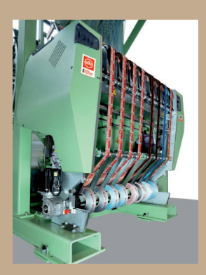
Electronically controlled winding up