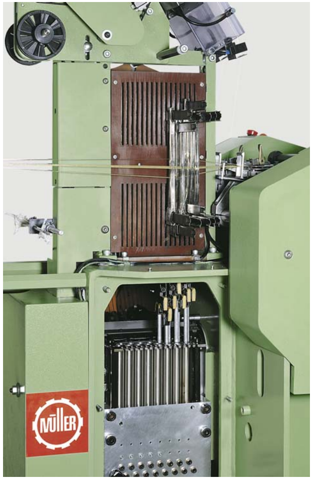
Patented shedding motion with air-suspended heald frame motion

The opto-electronic weft stop motion responds instantaneously to loose or missing threads.