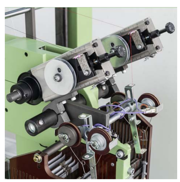
Weft feed with option "Wire spring compensation"