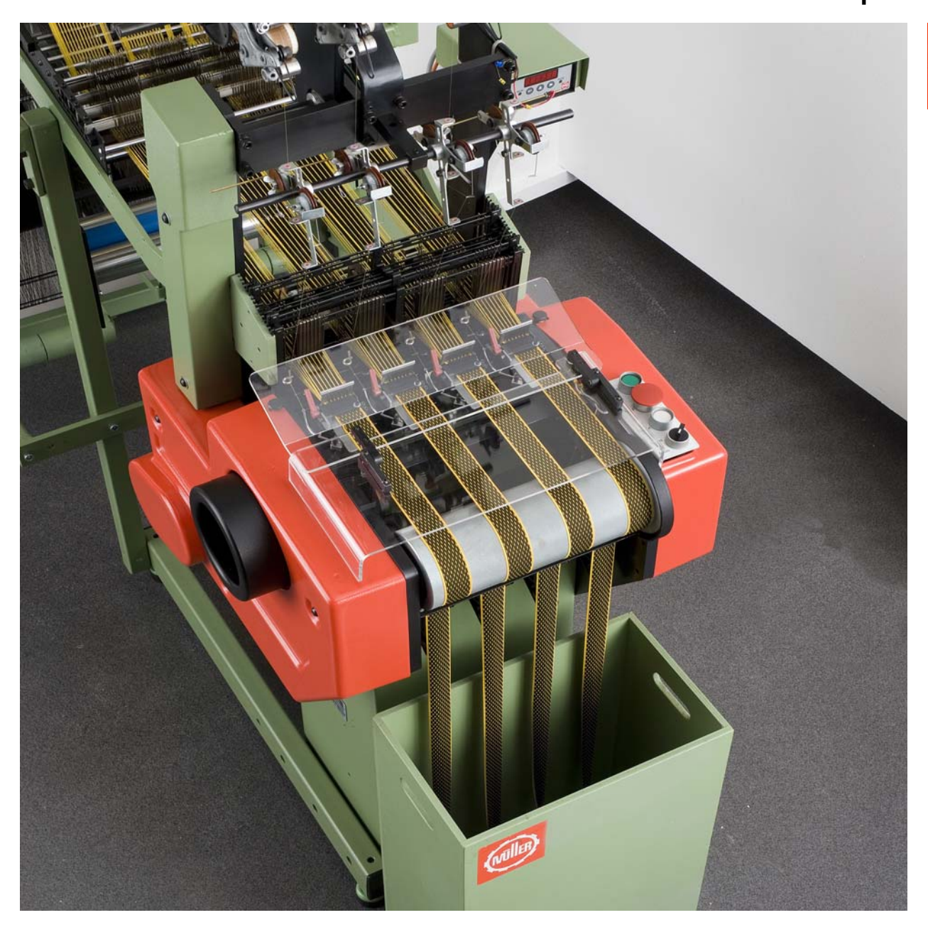
for elastic and non-elastic tapes