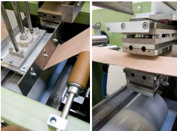
SU200 for the application of a silicone strip for selvedge end sealing