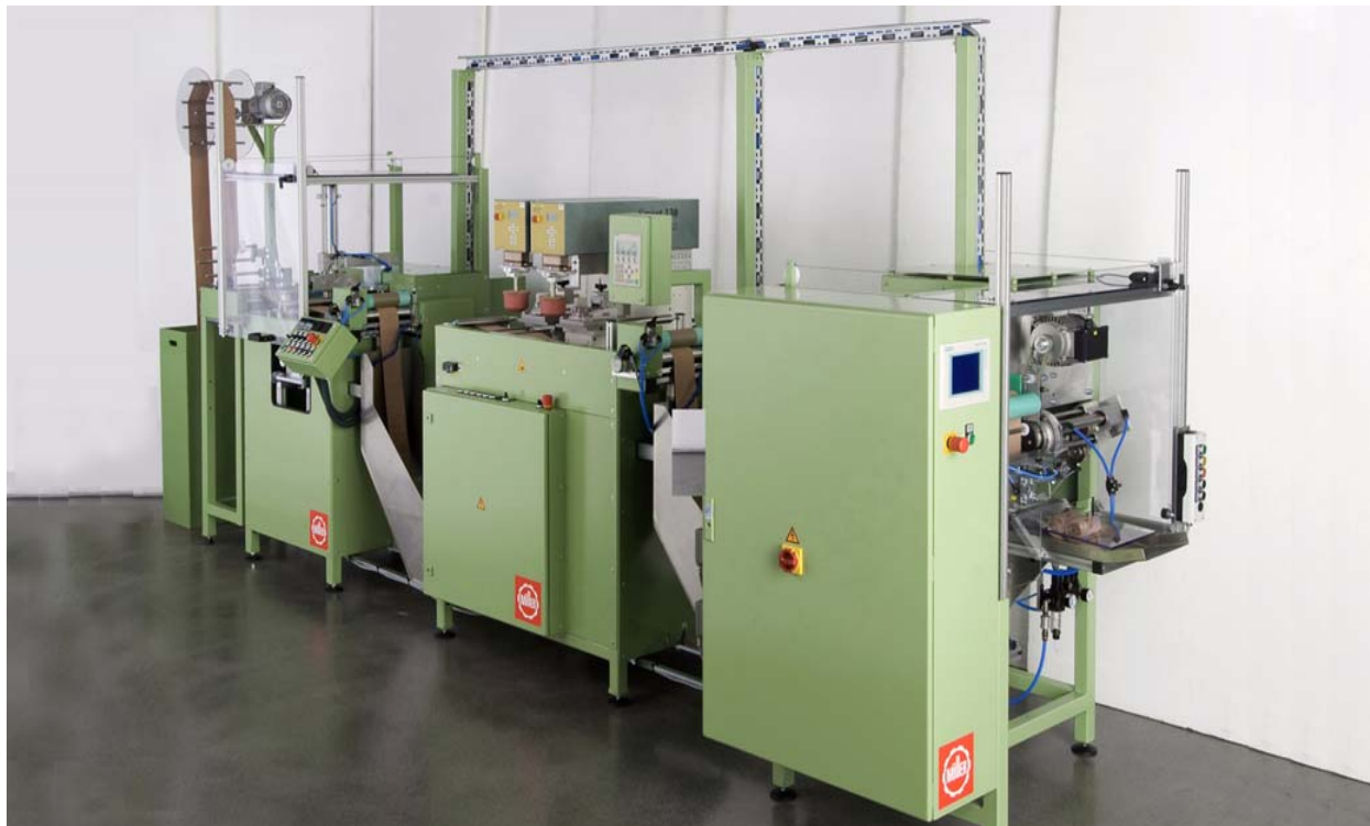
Production line SU200 / Tampon printing machine PP2 / VWA203