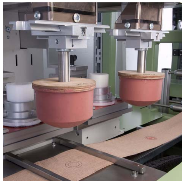
Tampon printing machine